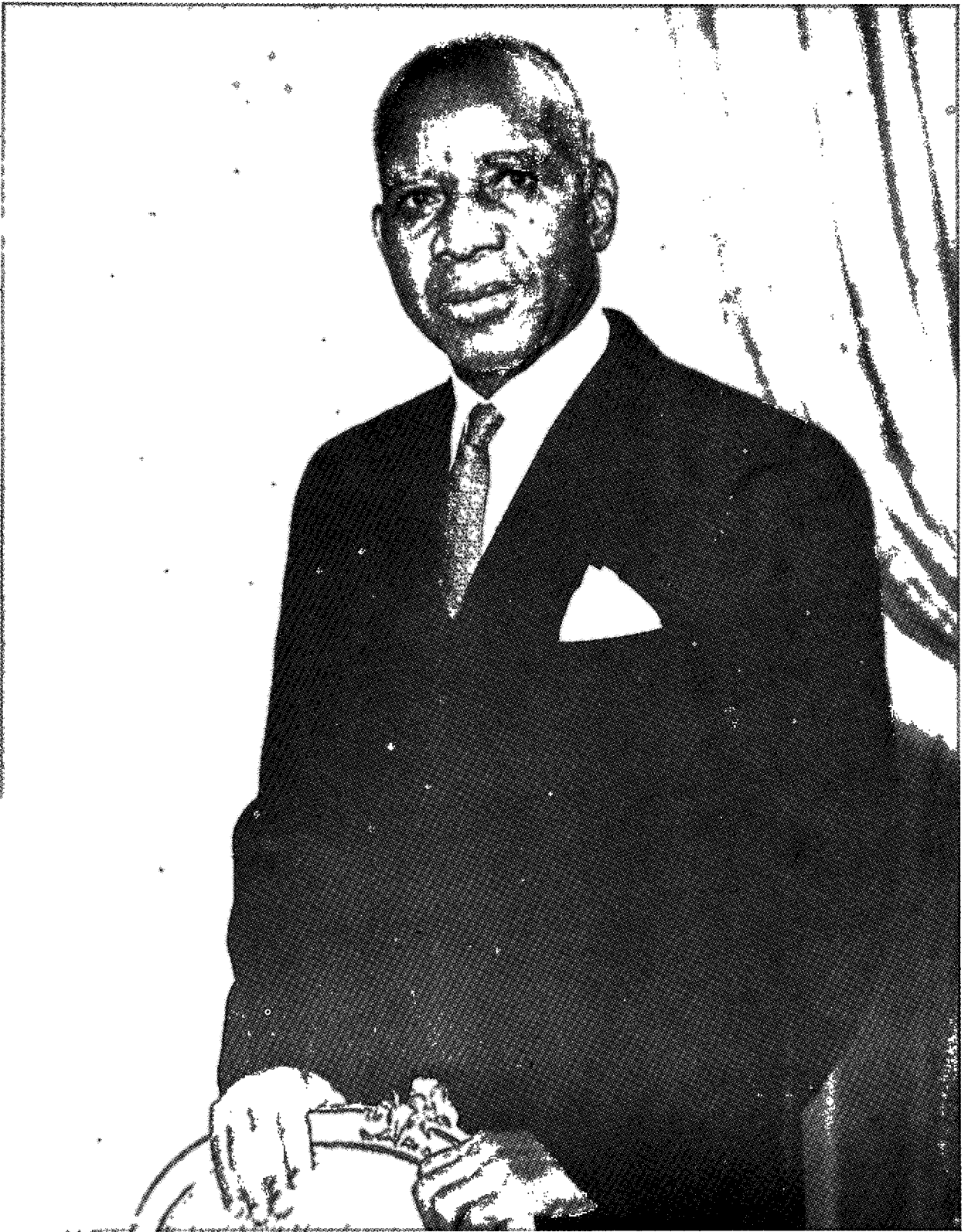
HIS EXCELLENCY THE LIFE PRESIDENT NGWAZI DR. H. KAMUZU BANDA