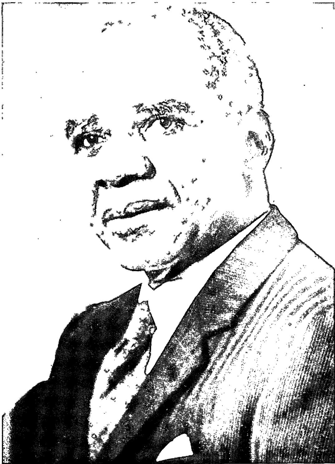
HIS EXCELLENCY THE LIFE PRESIDENT NGWAZI DR. H. KAMUZU BANDA