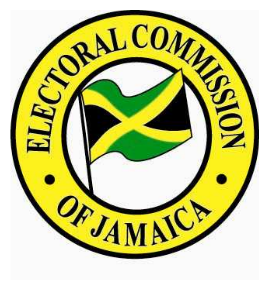
REPORT TO PARLIAMENT